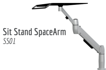
Sit Stand SpaceArm SS01