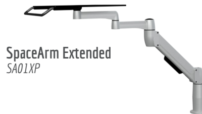
SpaceArm Extended SA01XP