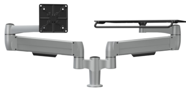
SpaceArm Long Double Hub SX01Z