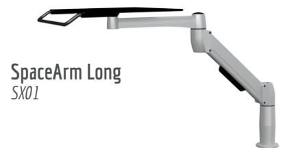
SpaceArm Long SX01