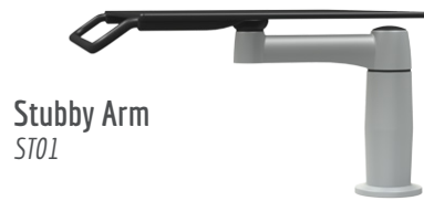
Stubby Arm ST01