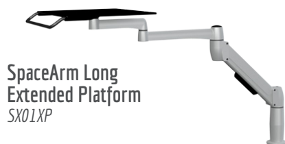
SpaceArm Long Extended Platform SX01XP