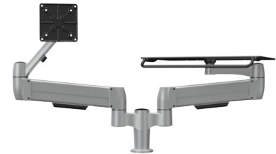
Sit Stand SpaceArm Double Hub SS01Z