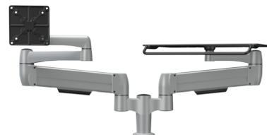
SpaceArm Extended Double Hub SA01ZXP