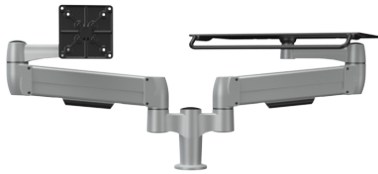
SpaceArm Double Hub SA01Z