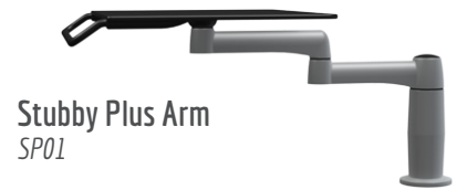
Stubby Plus Arm SP01