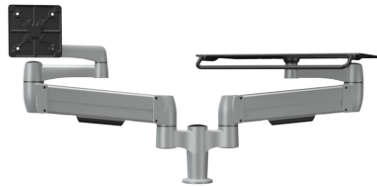
SpaceArm Extended Double Hub SA01ZXP